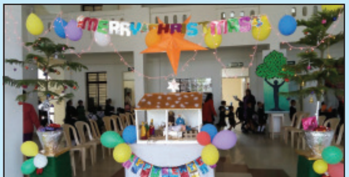
Christmas Celebration by Staff and Students of DPS, Dhenkanal