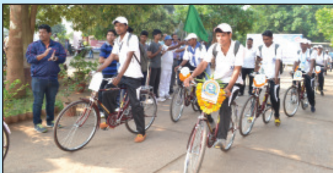
Participants of State Level Cycle Rally at Synergy, Dhenkanal