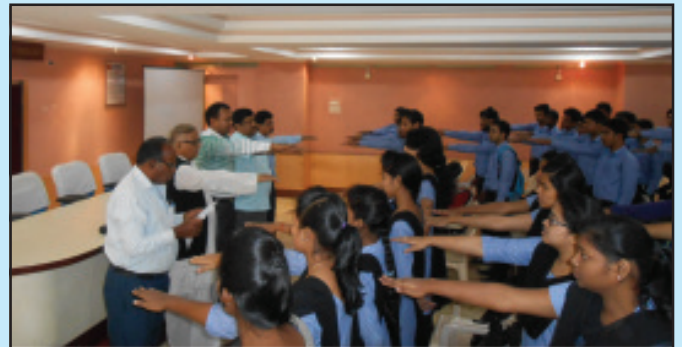
Oath Taking Ceremony by the Staff and Students of Synergy, Dhenkanal during the Observation of Constitution Day.