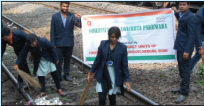
Observation of Swachhta Pakhwada by the students of Synergy, Dhenkanal at Dhenkanal Railway Station.