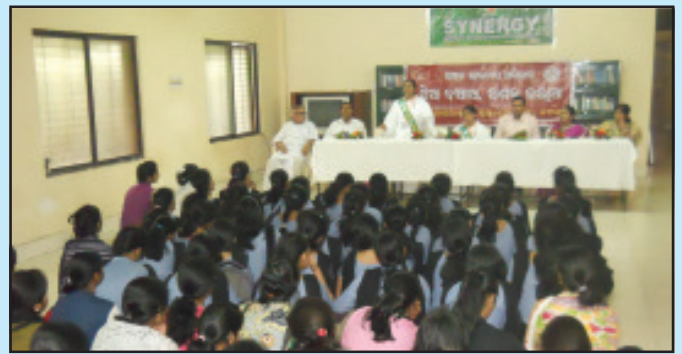
Beti Bachao Beti Padhao campaign at Synergy, Dhenkanal in association with Brahma Kumari Ishwariya Viswa Vidyalaya