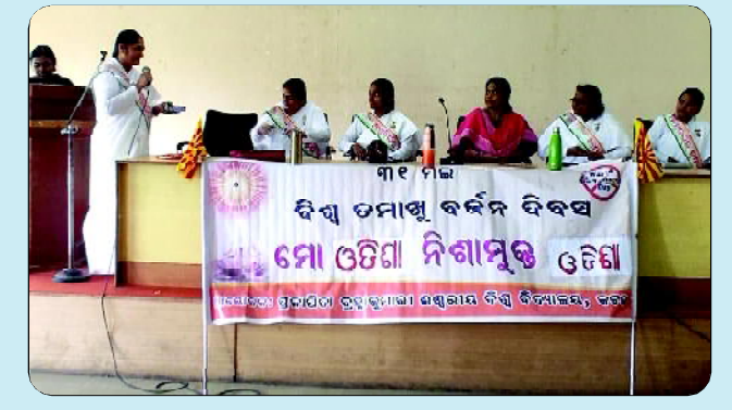
Celebration of World No Tobacco Day at Synergy, Bhubaneswar