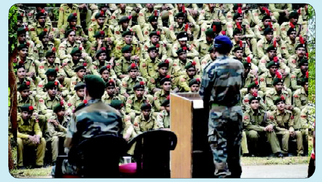
NCC Camp at Synergy, Dhenkanal