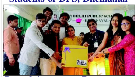
Dental Awareness Programme at DPS Dhenkanal