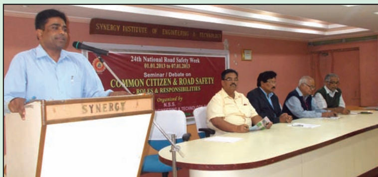
24th National Road Safety week was observed in the college where RTO & SDPO, Dhenkanal & President of the Blood Donors & Motivators' Association had been invited to create awareness among the students.