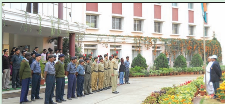
Celebration of Republic day at the premises of Synergy Institute of Engineering & Technology, Dhenkanal.