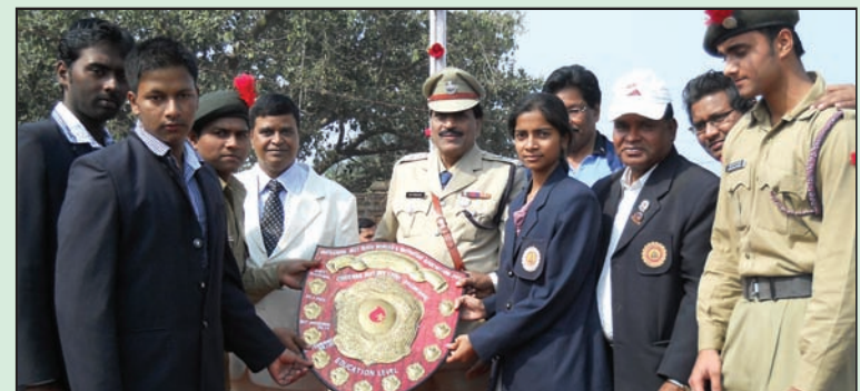
Students of Synergy, Dhenkanal receiving the trophy from the Collector, Dhenkanal for the highest blood donation.