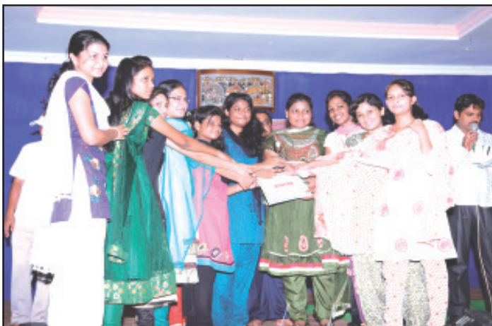
Girls' team of Synergy, Dhenkanal receiving the 2nd prize in District level Group song competition.