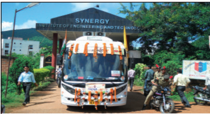
The Sacred Gopabandhu Jyoti leaves the campus of Synergy, Dhenkanal & sets off for a procession of the various places of Dhenkanal District.