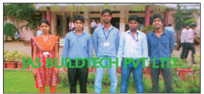
JAS BUILDTECH PVT LTD