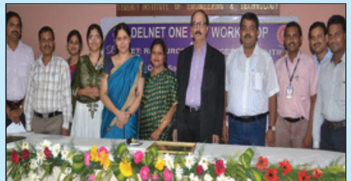
The dignitaries of the workshop on Automation of libraries with the Principal of SIET, Dhenkanal.