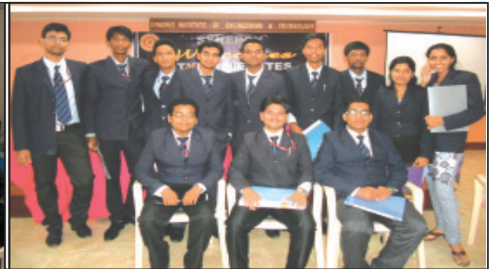
WIPRO Selected students