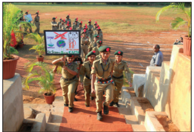
NCC Cadets at the TSC Camp at Synergy, Dhenkanal.