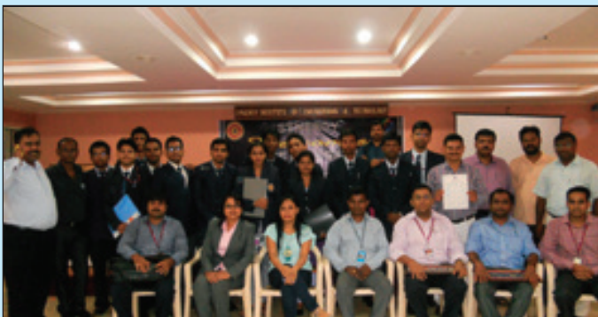
The Wipro selected students of SIET, Dhenkanal with the Principal, faculty members & the Wipro delegates.