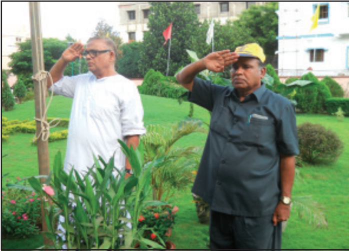
Independence Day celebration at Synergy, Dhenkanal