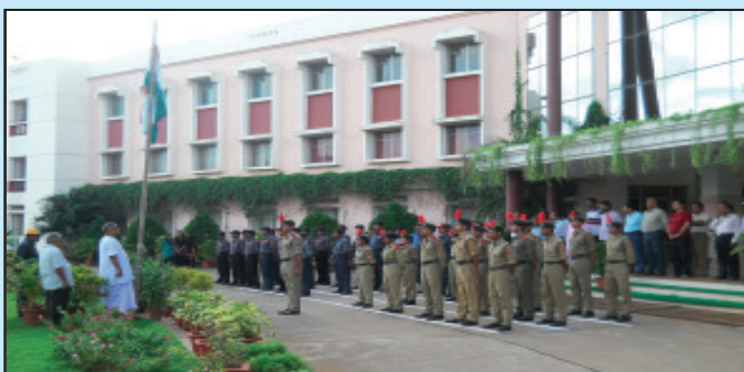
NCC Cadets giving a salute at the flag on the Independence day.