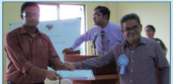
Certificates of participation being distributed at the Seminar "English for Engineers" at Synergy, Bhubaneswar.