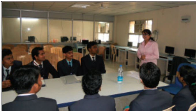
WIPRO delegate interacting with the students