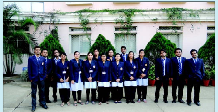
Students of Synergy, Dhenkanal selected for placement in WIPRO.