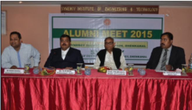
Meeting of the Alumni of Synergy Institute of Engineering & Technology held in the institute premises on 13.02.2015.