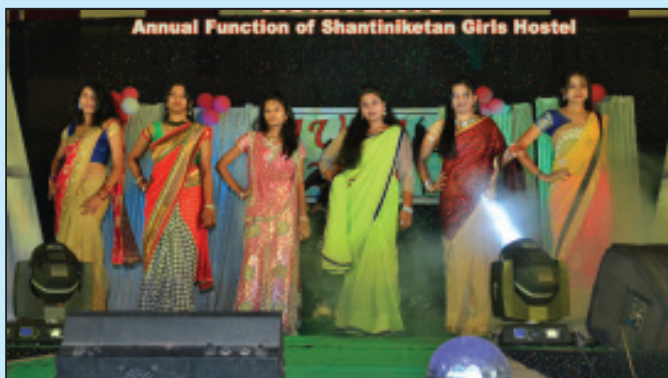
Colourful Annual Cultural function of Shantiniketan Girls' Hostel of Synergy Dhenkanal was organized on 22.03.2015.