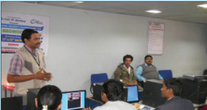
National Workshop on Android Application Development was organized by C. S Department at Synergy, Dhenkanal on 21st & 22nd January, 2015.