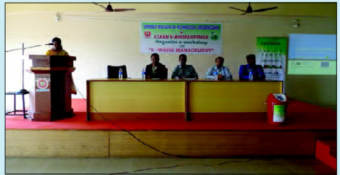
Awareness camp on E-Waste management conducted at Synergy, Bhubaneswar