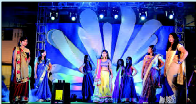
Annual cultural festival of Shantiniketan Girls Hostel and Kapilas Boys Hostel at Synergy, Dhenkanal