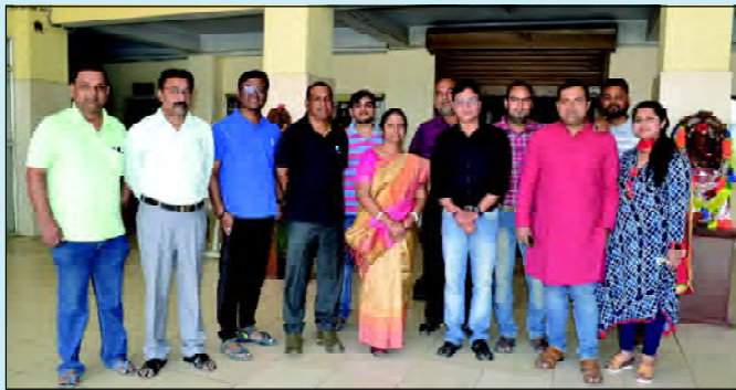
Alumni along with their family on a visit to Synergy, Dhenkanal