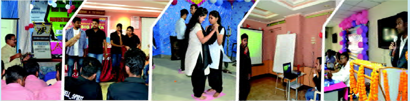
Events of Technical Festival conducted by department of CSE, EE, ME, CE & EC of Synergy, Dhenkanal