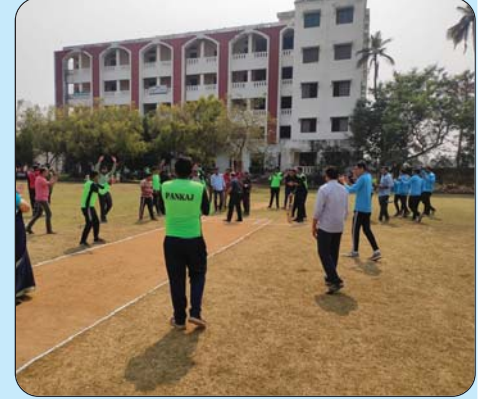
Inauguration of Synergy Premier League (SPL) at Synergy, Bhubaneswar,