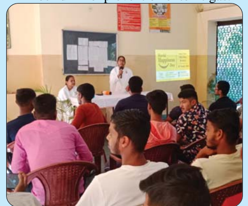
International Happiness Day Celebration at Synergy, Bhubaneswar