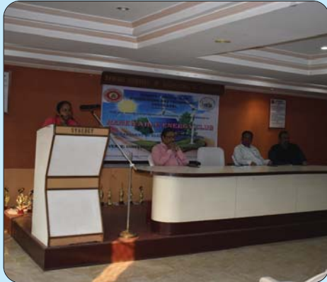
Renewal Energy Club Awareness programme at Synergy, Dhenkanal