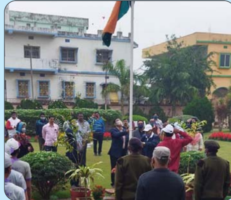
Republic Day Celebration at Synergy, Dhenkanal