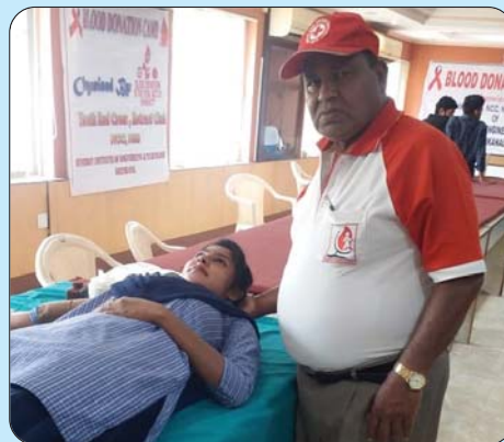
Blood Donation Camp at Synergy, Dhenkanal