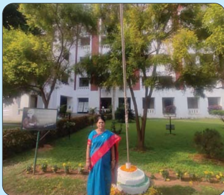
Republic Day Celebration at Synergy, Bhubaneswar