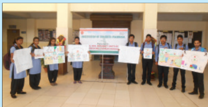
Drawing competition among students of Synergy Dhenkanal Occasion –Swachha Bharat Pakhada