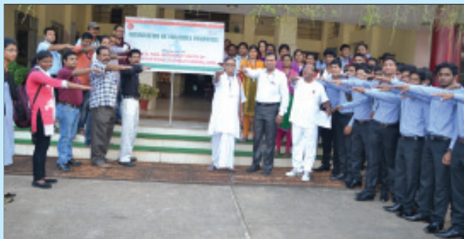
Students and Staff on taking Oath ceremony of Swachha Bharat Pakhada at Synergy Dhenkanal.