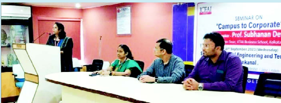
A seminar on "Campus to Corporate" was organised at Synergy, Dhenkanal in association with ICFAI Business School (IBS).