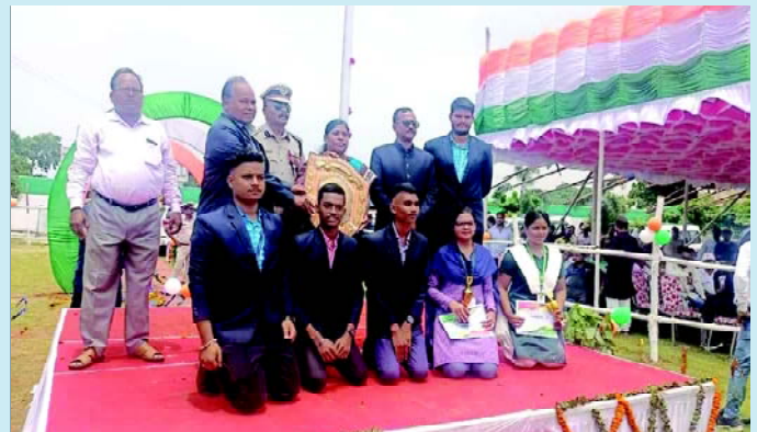
Accomplishments received by the Synergy Group of Institutions and its students in Dhenkanal on the 77th Independence Day.