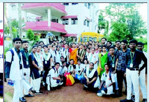
The students of Synergy College of Nursing, Dhenkanal had gone on a field visit to Adruta Children's home on 01.07.2023 and delivered a presentation on health education.