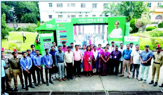
Odisha Start Up Yatra, 2023 van camp was conducted at Synergy, Dhenkanal.