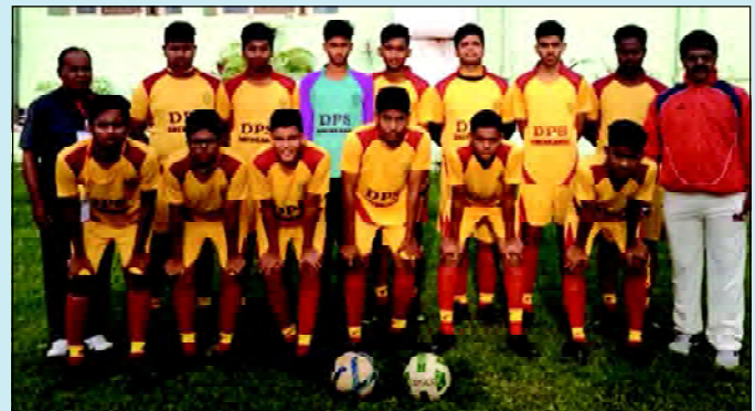
Football team of DPS Dhenkanal in CBSE Cluster Meet Football Tournament