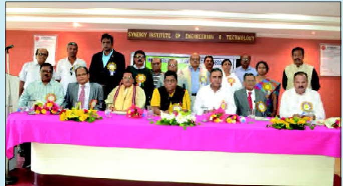
United Nation Day Celebration at Synergy, Dhenkanal