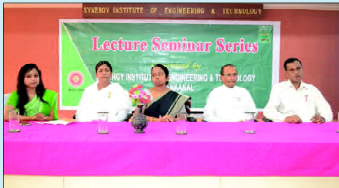
Program by Brahmakumari Eshwariya Viswavidyalay at Synergy, Dhenkanal